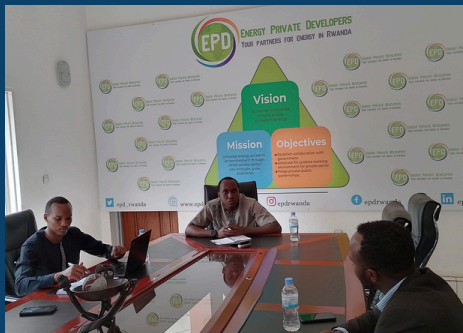
USAID Power Africa EECA