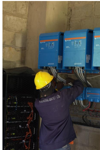
Image 4: 30kw AC/DC solar PV hybrid system installed at Good Neighbors Rubaya Gicumbi in RWANDA.