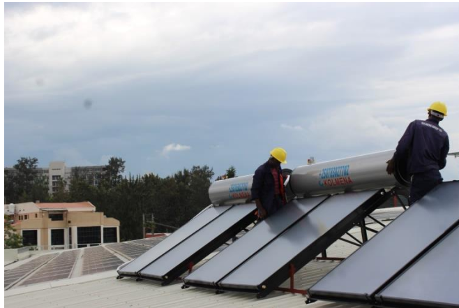
Image 1: 2,400 liters capacity pressurized flat plate solar water heating system installed at King Faisal Hospital in Kigali RWANDA.