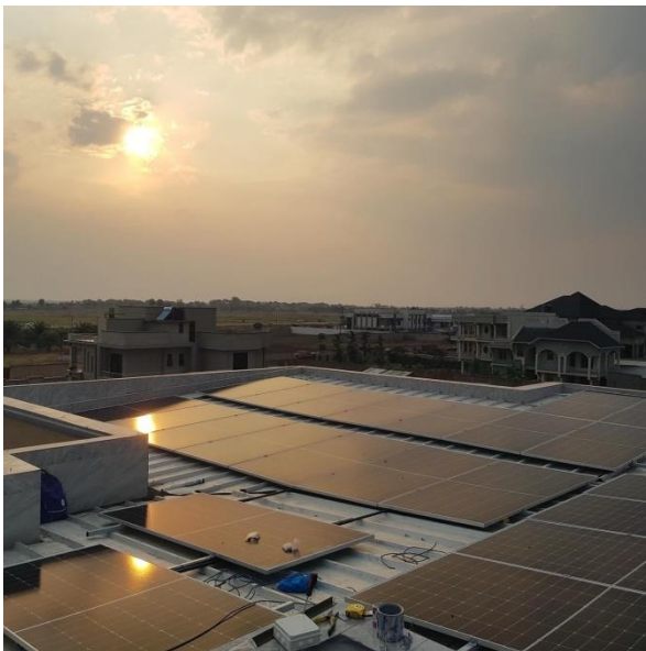
Image 3: 14.4kW PV system coupled with 15kWh LFP battery back-up ,installed at Bujumbura in BURUNDI .