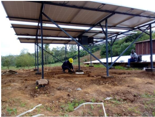
Image 7: Solarization of 4kw/5.5hp Electric Submersible Pump (ESP) with a 6.8kW of solar water pumping system at Ndera RWANDA.