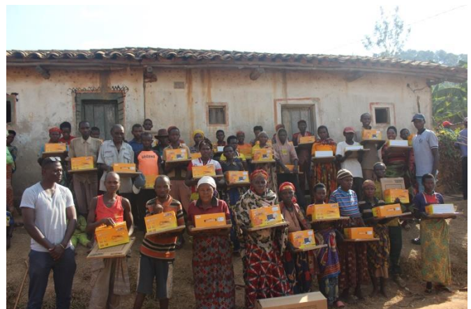
Image 6: A successful distribution of Solar Home System kits in one of the off-grid villages in Gisagara RWANDA under Renewable Energy Fund program (REF).