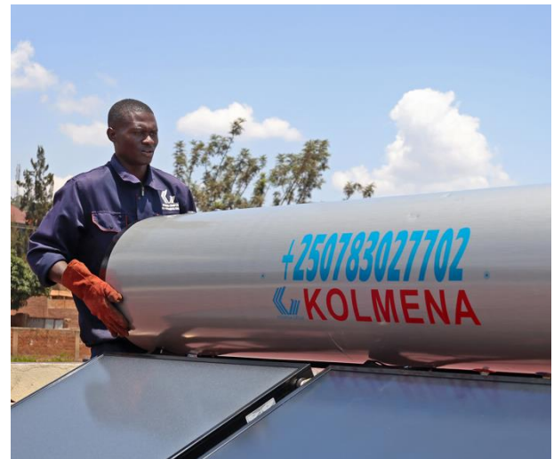
Image 2: Installation in progress of a 300L Kolmena pressurized flat plate solar water heater.