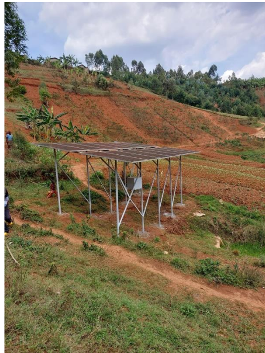
Image 8: 7.7 kW solar water pumping station installed at Muyogoro ,Southern province in RWANDA.