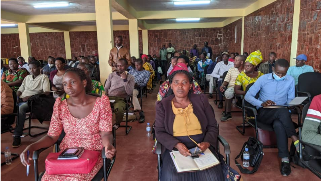
Local leaders attending the awareness campaign

In response to the Government's target to have all Rwandan households connected to electricity by 2024, EPD in partnership with Rwanda Development Bank (BRD) and Energy Development Cooperation (EDCL) conducted an awareness campaign for local leaders in all 30 Districts of Rwanda. The campaign was aimed at mobilizing local leaders to engage in sensitization of the citizens living in areas demarcated for Off-grid electrification to tap into the Renewable Energy Fund (REF) Programs designed to have all of them connected to electricity by 2024.