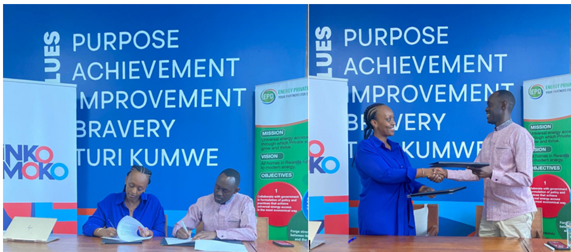
On the left, Inkomoko Entrepreneur Development Managing Director & on the right, EPD CEO

EPD signed an MoU with Inkomoko Entrepreneurs Development (a network of accelerators & loan funds that support entrepreneurs in