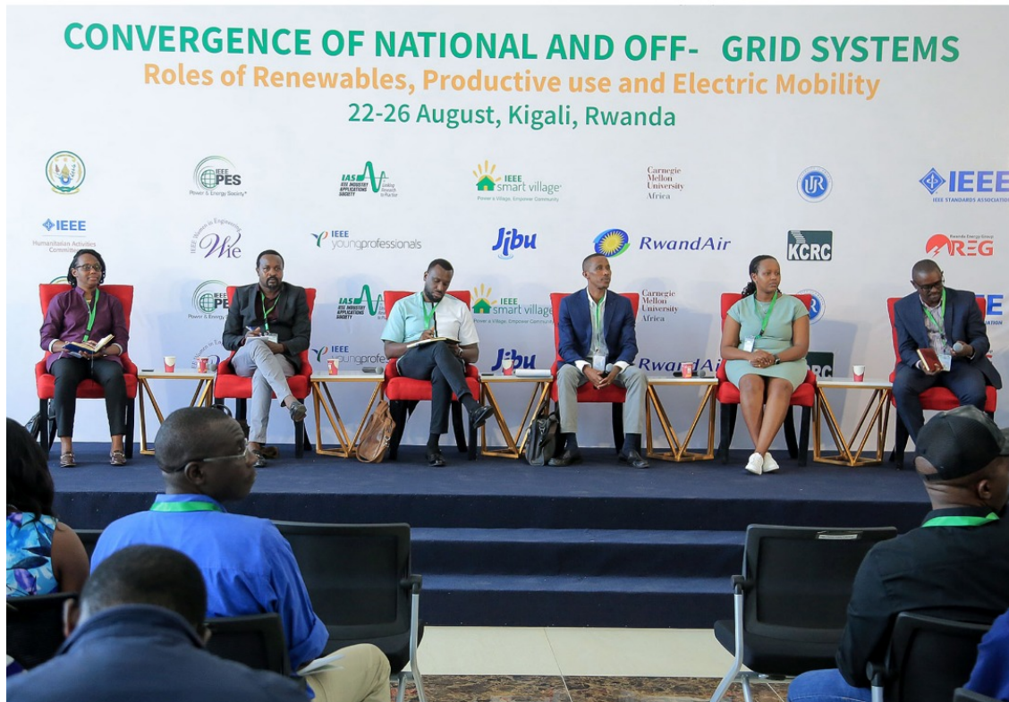
Panel session on Productive Use

EPD members participated and provided presentations on different topics at the IEEE PES & IAS Power Africa 2022 conference. The presentations covered the following topics: