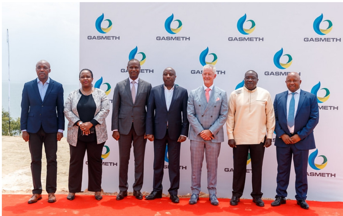
Officials in a group photo during the groundbreaking ceremony of the Compressed Natural Gas project

GOV'T OF RWANDA AND GAS METH LAUNCHED A $350M NATURAL GAS PLANT IN KARONGI DISTRICT