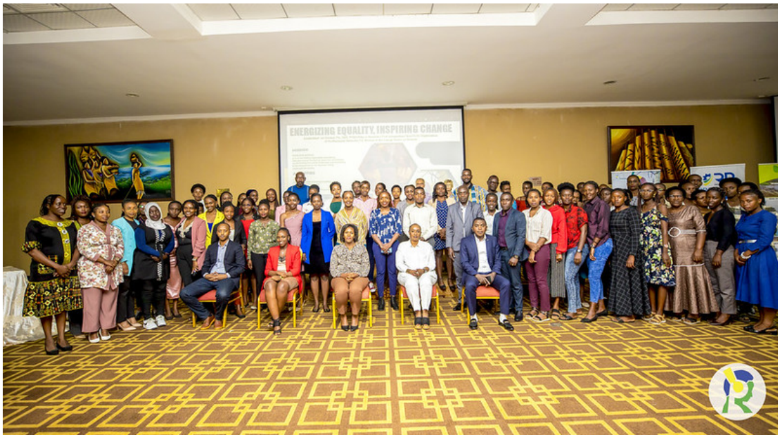
Group photo of participants

POWERHer is a network of women in the energy sector, supported by the Women in Rwandan Energy (WIRE), an initiative implemented by the USAID through the Power Africa East Africa Energy (EAEP) Project as the first certified independent non-profit organization of a professional network of women in the energy sector. POWERHer is an organization that empowers Rwandan women to achieve positions of leadership and influence in the energy sector.