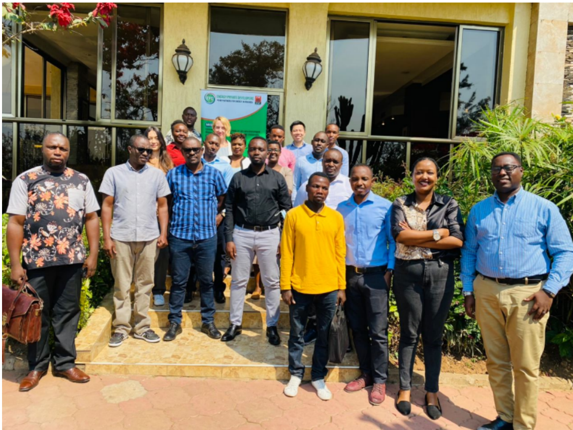
Group photo of institutions representatives

EPD in partnership with GOGLA EPD engaged in the productive use of Renewable Energy with the aim of scaling up the effective use of energy for food security & economic empowerment in Rwanda. Constructive inputs were shared by different stakeholders including public & private institutions, and development partners.