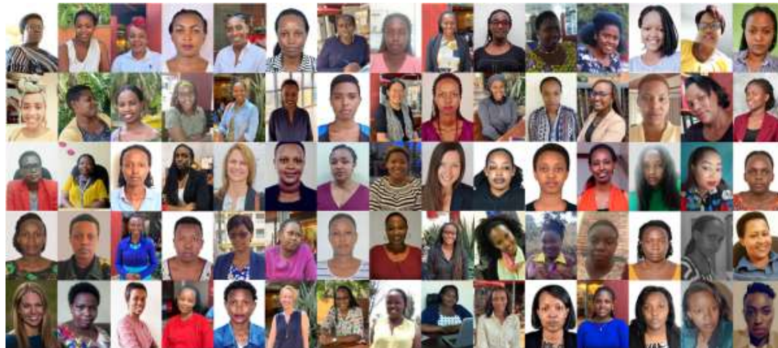
Women in PowerHer

USAID SUPPORTS RWANDA'S FIRST PROFESSIONAL NETWORK FOR WOMEN IN ENERGY