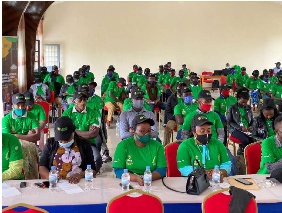
Deal Origination Agents in Musanze district