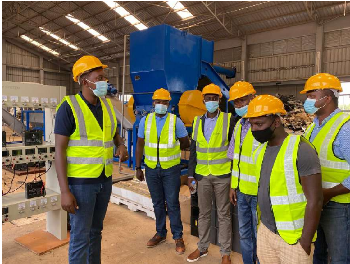
EPD membres visiting EnviroServe facility in Bugesera