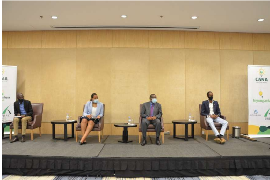
Minister of Infrastructure (in the middle) Launching Subsidy program