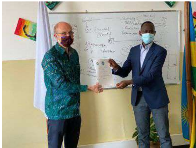
Left side: Former UR Vice-Chancellor with EPD CEO