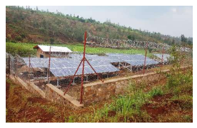
40 kWp Solar PV Mini-grid in Karusi- Burundi