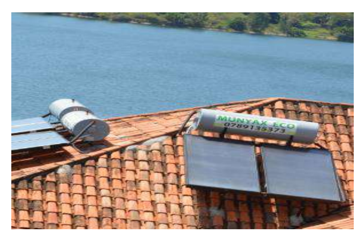
Solar water Heater at Bethanie Kibuye -Rwanda